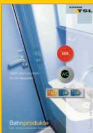
Level monitoring/Wet rooms

ESCHA TSL GmbH Elberfelder Str. 1 . 58553 Halver . Germany Sales: Phone: +49 2353 66796-0 . Fax: +49 2353 66796-99 info@escha-tsl.de . www.escha-tsl.com